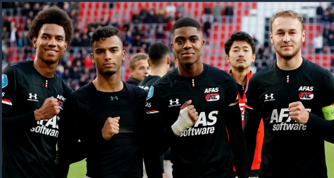
Self-trained generated huge transfer revenues