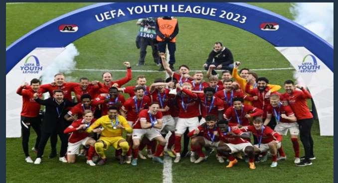
U20 wins UEFA Youth League after beating European giants